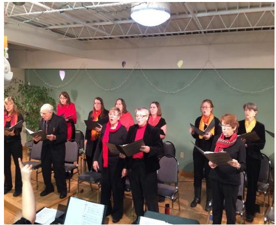
Warming up for the Solstice celebration December 19, 2015

What an exceptional season of music at James Reeb, with original music, large groups, trios, solos and guest instrumentalists! Amidst confused crocuses and blooming snapdragons, we sprang into Winter Solstice preparations this past month. Thank you to each and every person who made it such a beautiful event. Sparks and light are spreading throughout, and by January we'll be on "Fire, so be sure to come for the January 3 rd service!