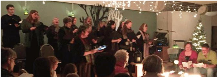
JRUUC Choir at the Winter Solstice Celebration

Cheers to a splendid year of music! Thank you for all that you have contributed in 2016.