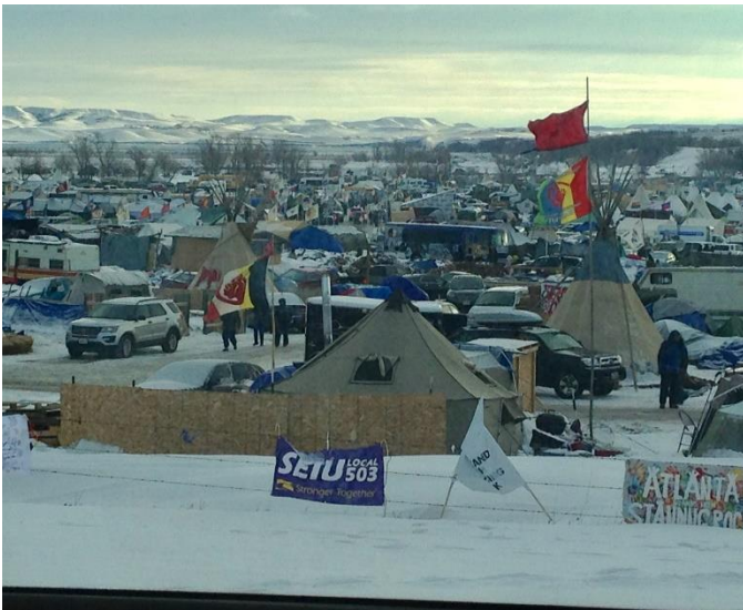
Standing Rock camp with snowy landscape